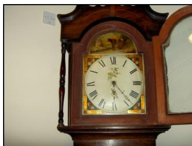
Clock face and close up of the work of William Pratt, http://thedales.org.uk/the-clockmakers-of-askrigg-wensleydale