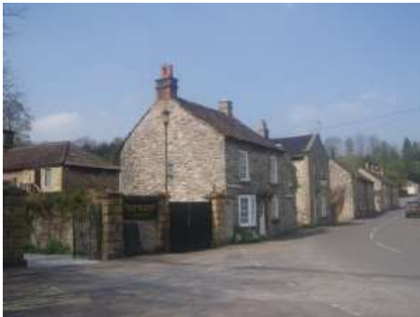
Fennel Street today