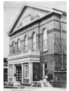
Queen Street Chapel, Sheffield from the website of the Central United Reformed Church, Sheffield.