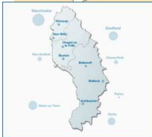
The High Peak area relative to surrounding principle towns.