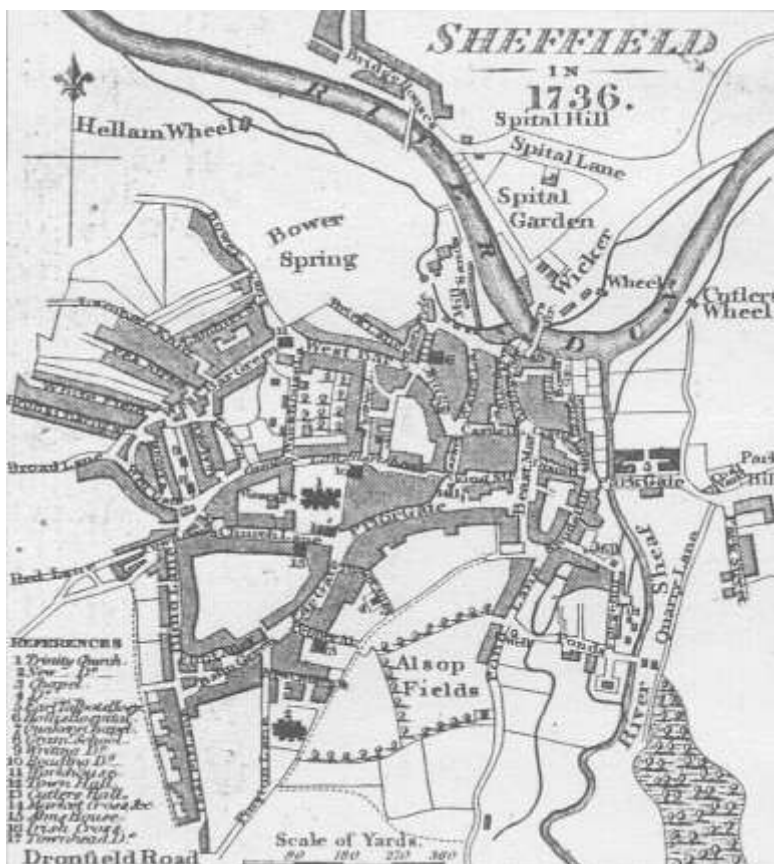
Gosling's map of Sheffield in 1736

Of the four churches in the centre of Sheffield, the earliest is Sheffield Parish Church, dedicated to St Peter & St Paul, or the Holy Trinity. Throughout the following account I have referred to it by its later name of SS Peter & Paul, Sheffield to distinguish it from St Paul's Church built in 1740 in Norfolk Street 4 . A typed transcript at Sheffield Archives covers SS Peter & Paul's parish registers from 1560 to 1812 and additional information up to 1837 has been found at Sheffield Records Online.